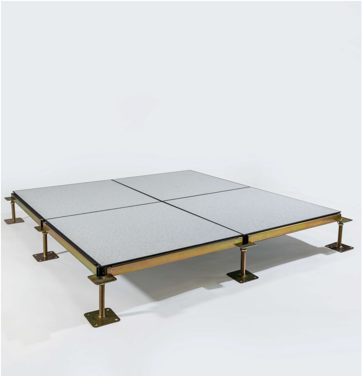
FS800 – HPL FINISH

Work smarter with raised access flooring