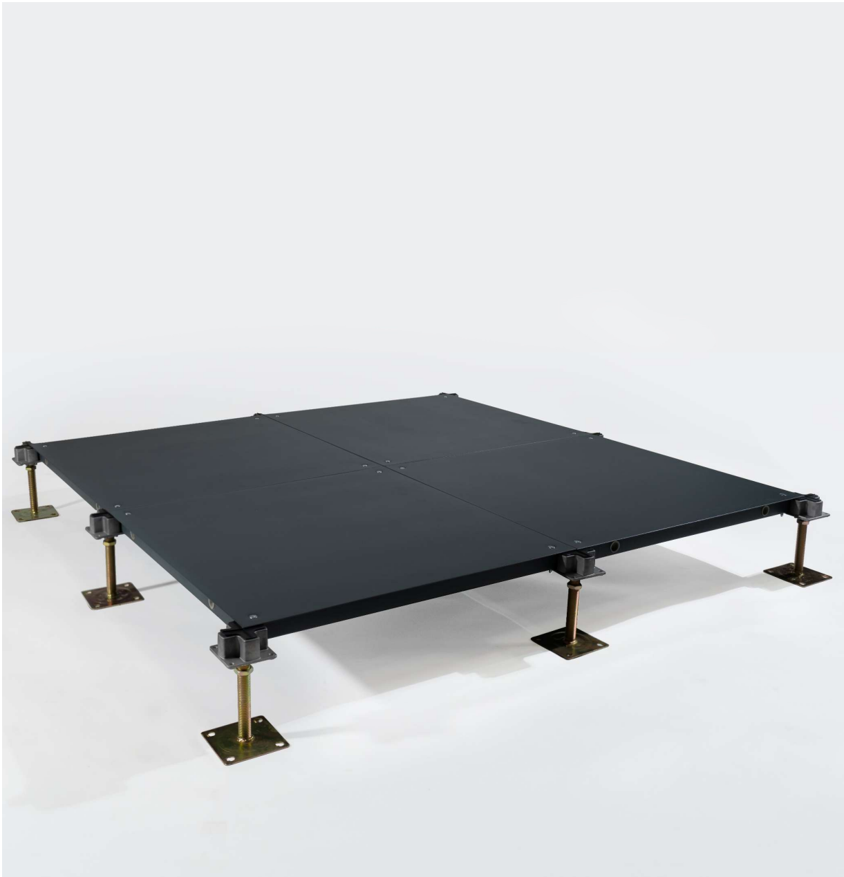
FS800 – BARE FINISH

Work smarter with raised access flooring